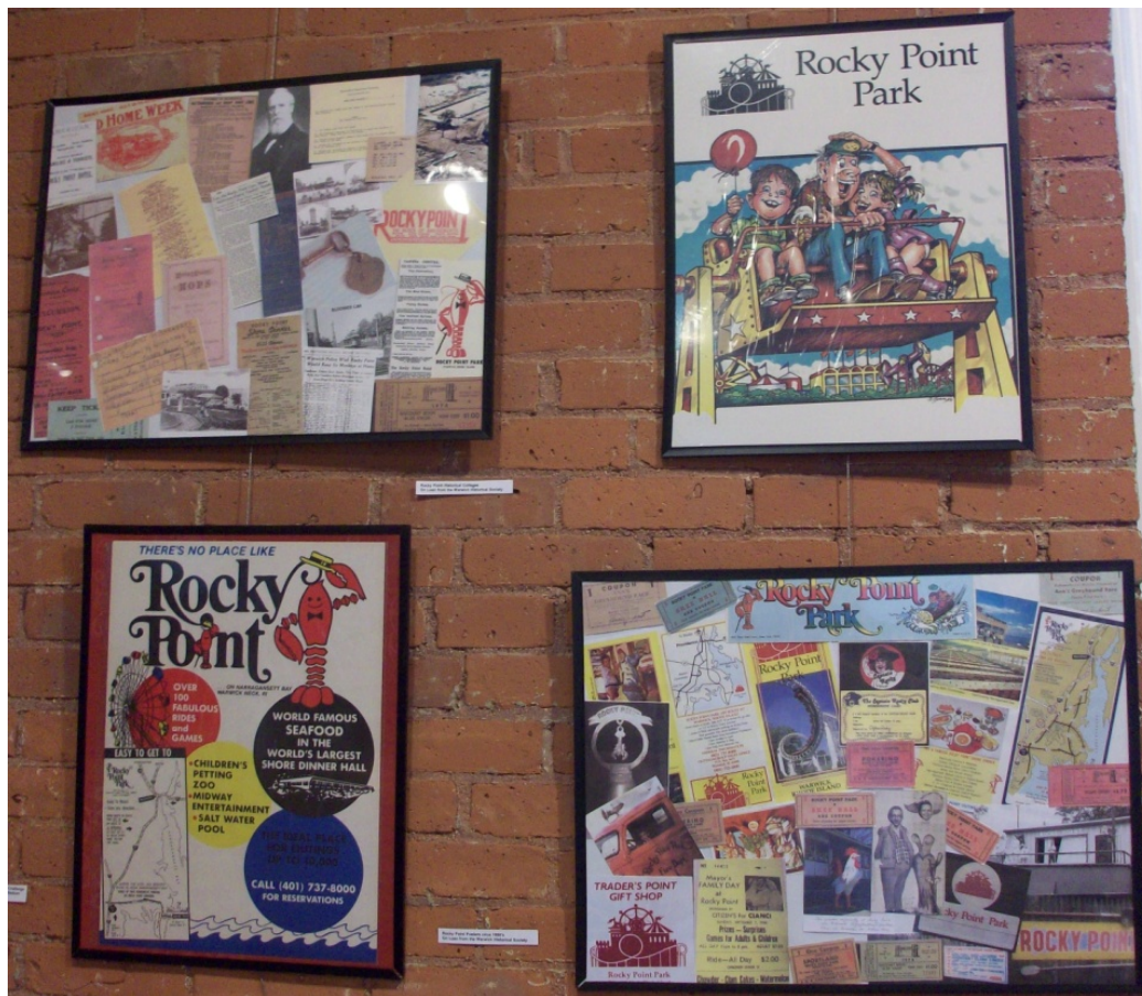
Collages and Display Boards By Felicia Gardella

We will also be displaying photos from the exhibit in our display case at City Hall. This display will remain until after the referendum vote in November.